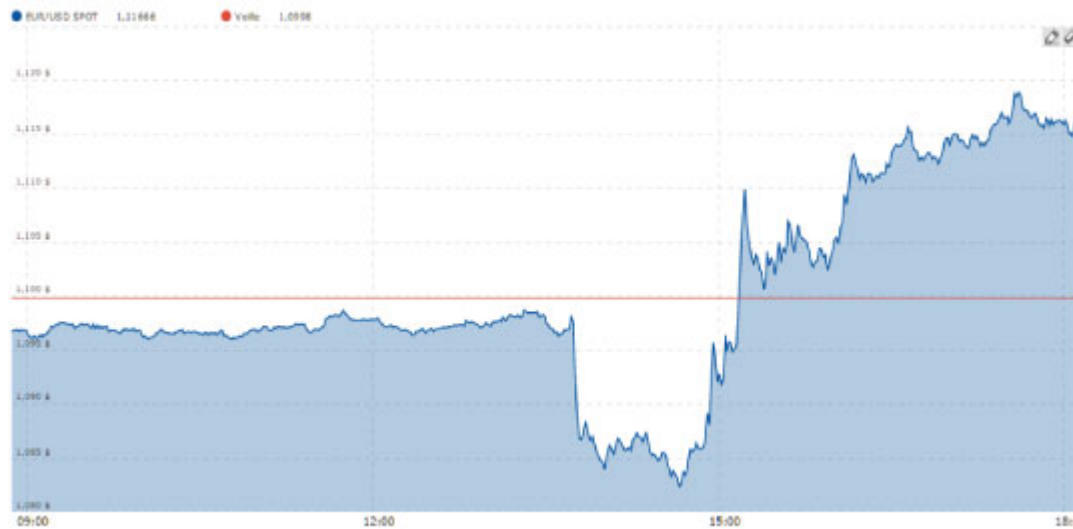
Figure. Euro-dollar exchange rate, day of 10 March 2016.

generated by the channel of expectations, we will see in the weeks and months to come whether capital movements induced by the decisions taken will have the effect expected on the euro exchange rate.