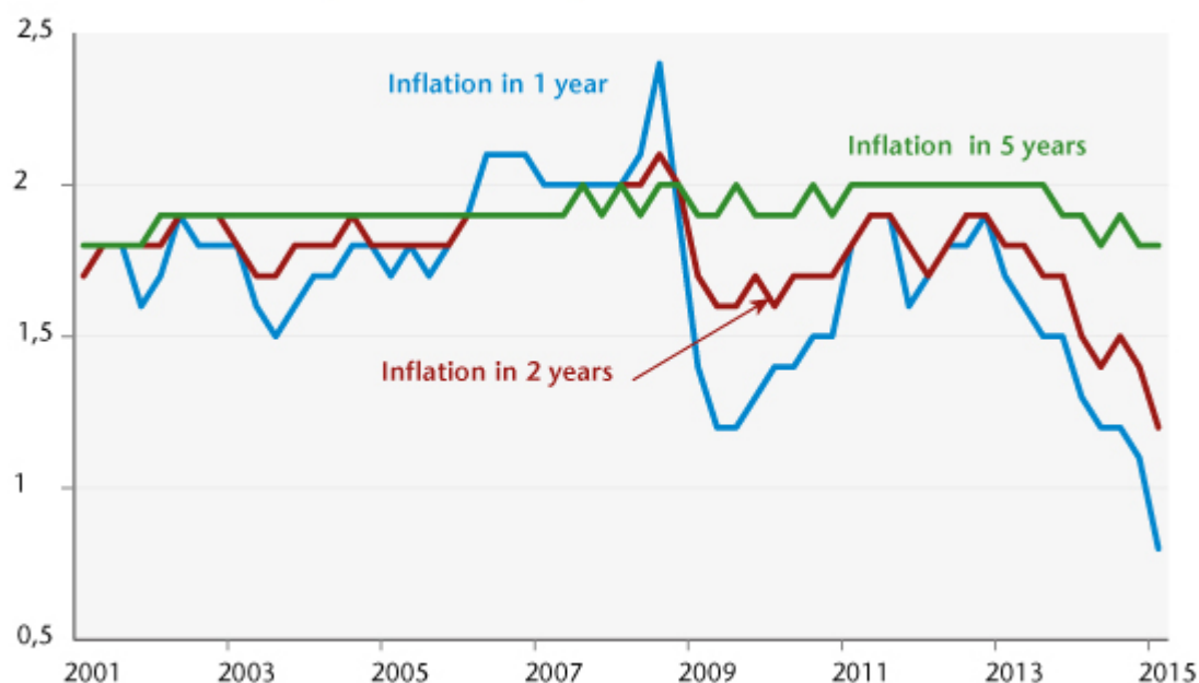
Figure. Inflation expectations in the euro