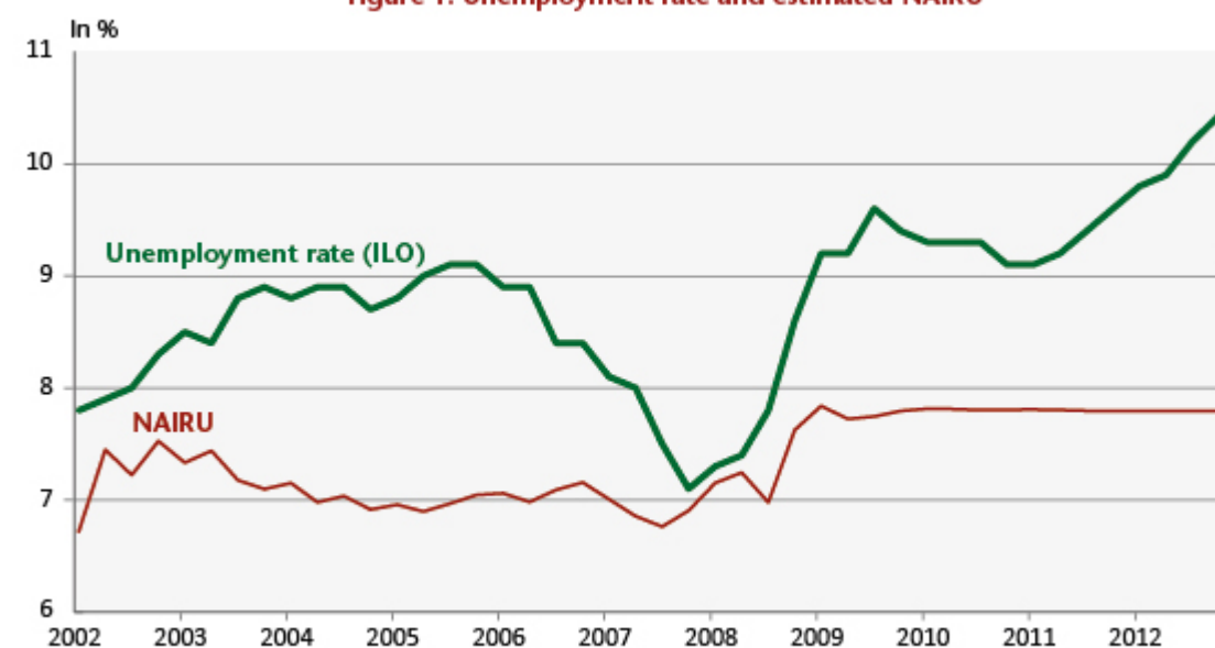
Figure 1. Unemployment rate and estimated NAIRU

Second, the NAIRU is estimated at 7.2% on average over the years 2000-2012, with an average inflation rate of 1.9% over the period. Inflation rose to an average 7.7% over the period 2008-2012 (Table 1) and to 7.8% in 2012 (Figure 1).