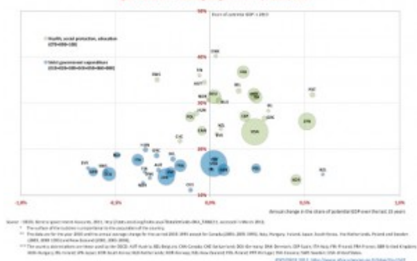
Figure 1. Breakdown and changes in government expenditures, OECD

Figure 1 shows the unique position of France. In 2010, “government expenditure” in the strict sense (that is to say, not individualizable, such as domestic and foreign security, administration, miscellaneous expenditure on interventions) represented 18.2% of the country’s GDP. In terms of this “strict government expenditure”, in 2009 France ranked 10th among the OECD countries (see also Figure 2). If the “competition for being thin” covered only expenditure in this narrower sense, France would be relatively average compared to other bigger-spending countries like the United States, Portugal and Italy. Moreover, unlike the UK, the US or Ireland, over the last 20 years France has cut “strict government expenditure”, in a rather unexpected demonstration of fiscal control.