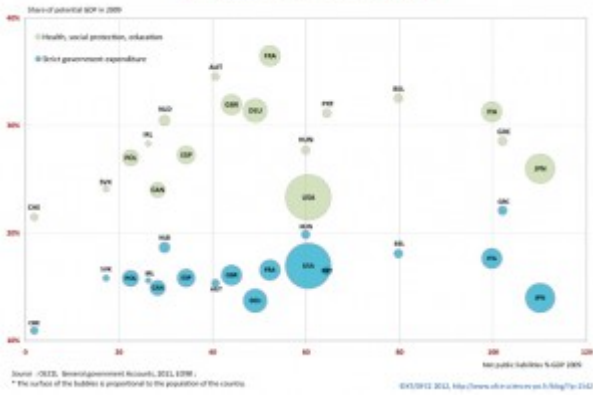
Figure 3. Government expenditures and net public debt, OECD