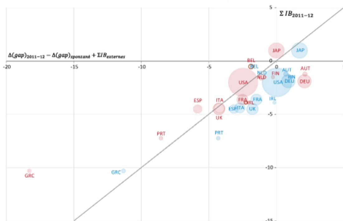
Graphe 2 : Changes in the output gap and the impulse 2011-2012

Source: OECD, Economic Outlook 91, June 2012. The year 2012 is a projection (OFCE forecast October 2012). The area of the bubbles is proportional to real GDP in 2011 ($ PPP).