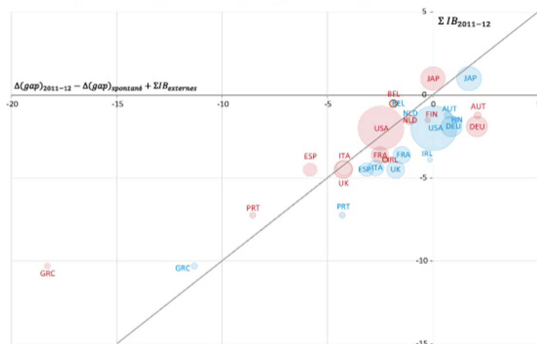
Graphe 2 : Changes in the output gap and the impulse 2011-2012

Source: OECD, Economic Outlook 91 , June 2012. The year 2012 is a projection (OFCE forecast October 2012). The area of the bubbles is proportional to real GDP in 2011 ($ PPP).