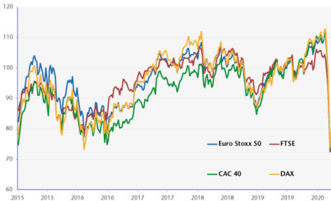
Figure 1. Changes in the main stock market indexes

Base 100: average for the year 2019.